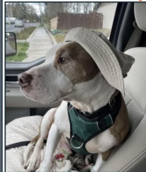
Moose riding shotgun as he heads to the park with his foster family

Moose and Kermit are two shelter pitties currently being fostered