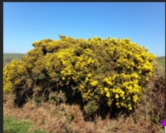
Gorse: BIG thorns, bright yellow flowers

Source: Surfside Covenants Section 5.4. Owners shall be responsible for keeping their platted parcel free of gorse, tansy ragwort and other noxious weeds.